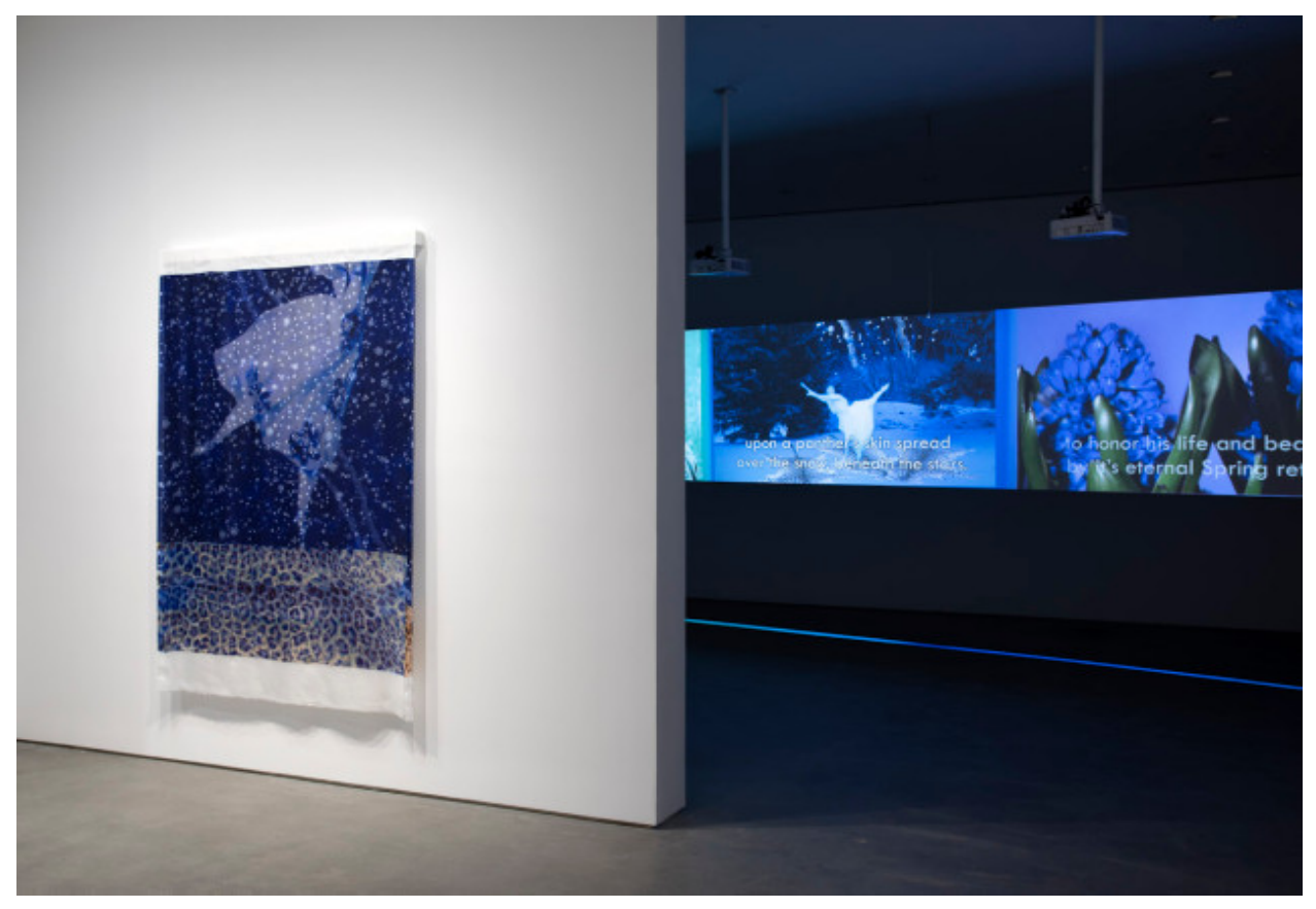
Installation view, 'T. J. Wilcox: Spectrum,' at Gladstone Gallery, New York, 2020.

In many ways, Spectrum can be thought of as a tribute to gay myth-making. Each film flows with images in its own distinct rhythm and sequence. The colors bleed on their edges and bear alternate shades of reds or blues, similar to a painter's palette.